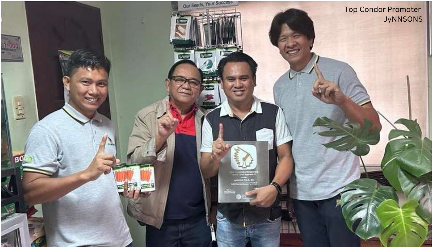
Top Condor Promoter JyNNSONS

were awarded accordingly. Sales for Avenger (broccoli), Marathon (broccoli), Fukutomi F1 (carrot), Sugarland F1 (carrot), Scorpio F1 (cabbage), Panigang Best F1 (pepper), and Nova Ferti-K 0-0-61 (Crop Care) were included in the awarding.