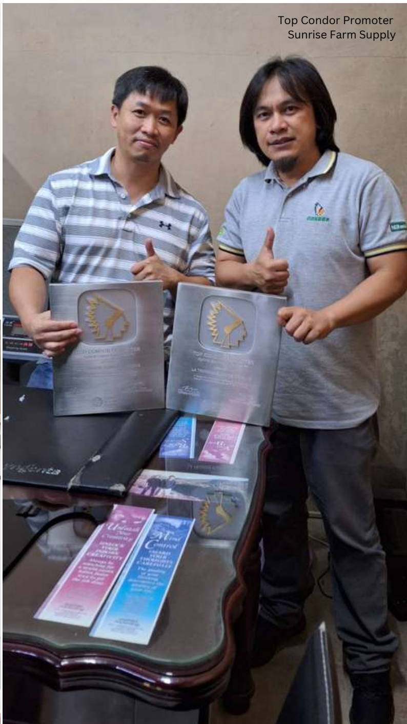
Top Condor Promoter Sunrise Farm Supply

Five outstanding dealers reaching an increase averaging to 116% were awarded. Among the awardees were Sunrise Farm Supply, Jay Ann's Agri Supply, Pontiac Farm Supply, JyNNSONS Philippines Inc., and S & P Enterprises Inc.