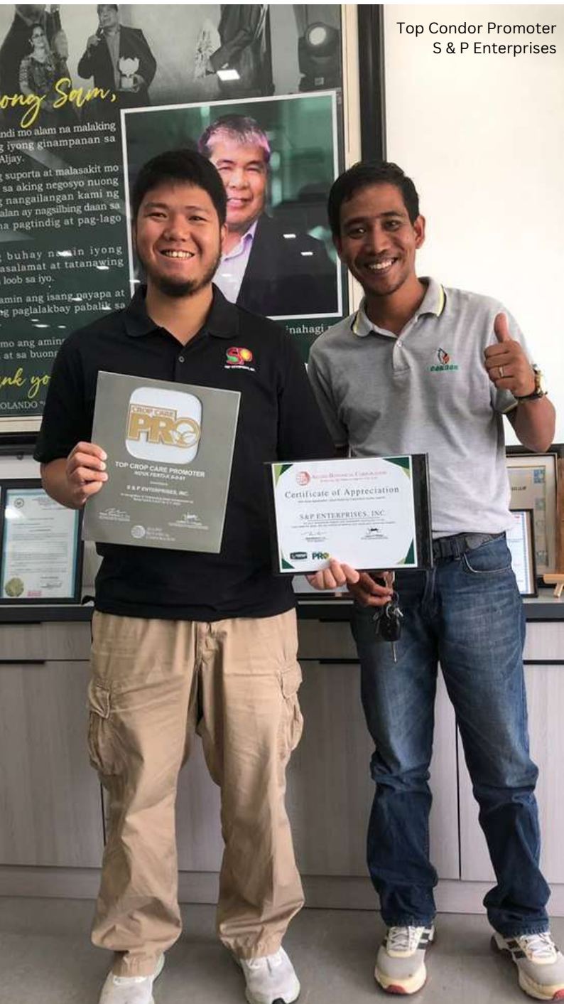
Top Condor Promoter S & P Enterprises