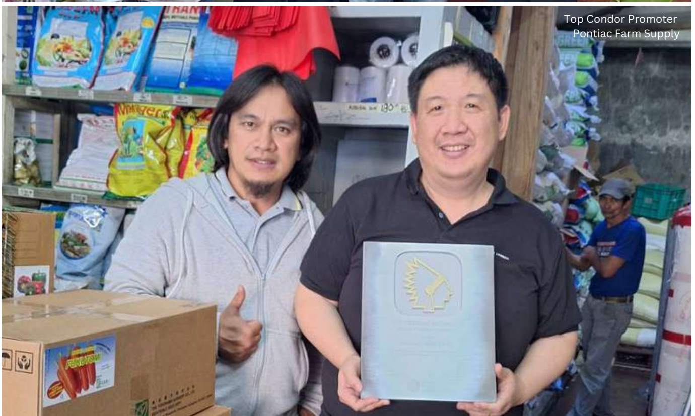
Top Condor Promoter Pontiac Farm Supply